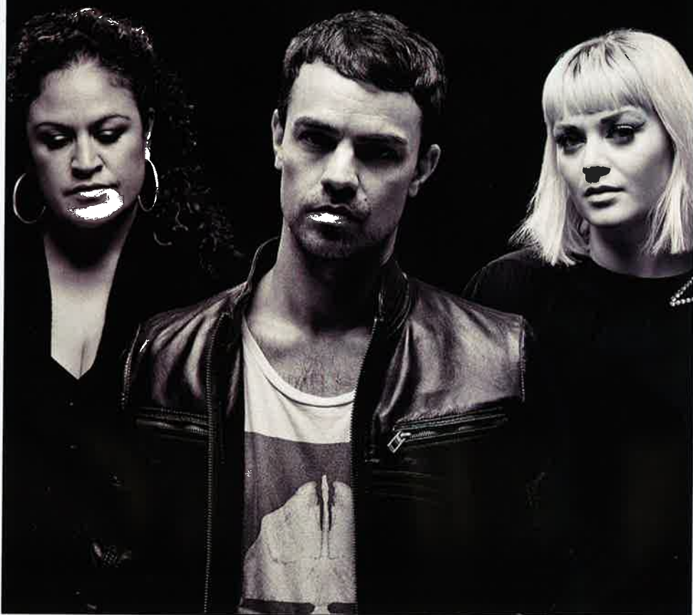
FROM LEFT